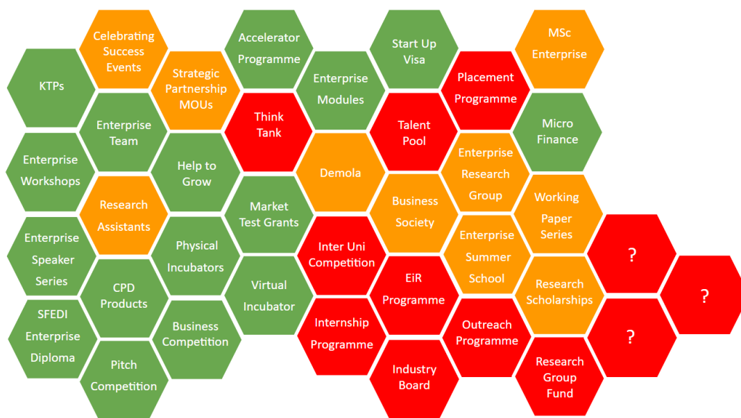
Figure 5: Visual Representation of UWS internal ecosystem

signifying unknown unknowns allowing for new ideas to be added following discussion around development of the current mapped ecosystem.